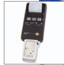
testo 177-T1 without display, data is documented on the fast testo 575 printer