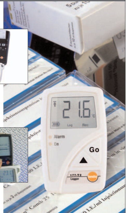
Long-term temperature logging with immediate display of limits exceeded e.g. during transport, in refrigerated rooms, warehouses etc. with testo 177-T2, with display